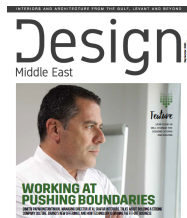
( https://www.cbnme.com/magazines/design-me-september-2020/ )