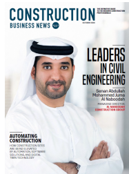
( https://www.cbnme.com/magazines/construction-business-news-me-october-2020/ )