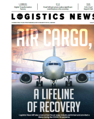
( https://www.cbnme.com/magazines/logistics-news-me-august-2020/ )