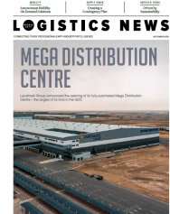
( https://www.cbnme.com/magazines/logistics-news-me-september-2020/ )