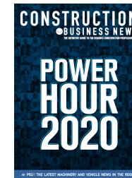
( https://www.cbnme.com/magazines/construction-business-news-me-august-2020/ )