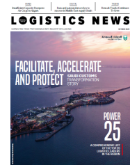
( https://www.cbnme.com/magazines/logistics-news-me-october-2020/ )