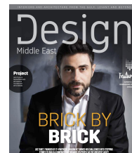
( https://www.cbnme.com/magazines/design-me-august-2020/ )