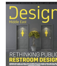
( https://www.cbnme.com/magazines/design-me-july-2020/ )