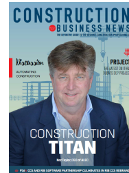
( https://www.cbnme.com/magazines/construction-business-news-me-september-2020/ )