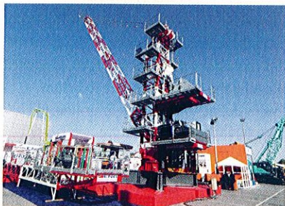
Bothani ENG says it will be the first tower crane manufacturer in the Middle East

The company also said it is developing a flat-top tower crane with a 90 metre jib length and a maximum capacity of 4.7 tonnes at the jib-end.