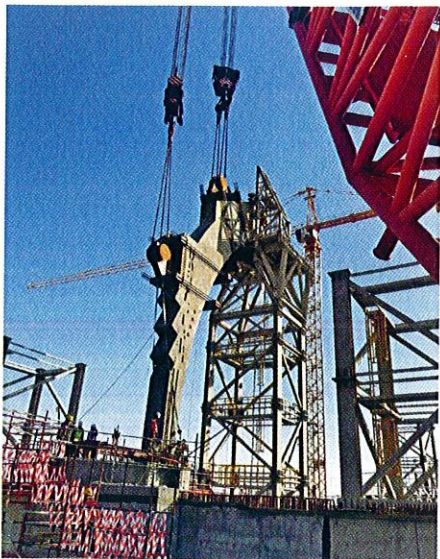
Mammoet is using nine crawler cranes for the construction of Kuwait International Airport