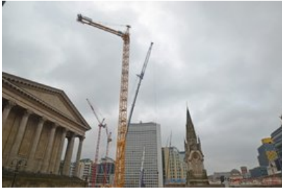
Above: The first Potain tower crane being erected

The 77-metre high Potain MD560B M25 saddle-jib crane has been assembled with 32 tonnes of ballast. It is configured with two falls of rope to lift a maximum of 12.5 tonnes, or 7.0 tonnes at maximum radius of 70.0 metres.