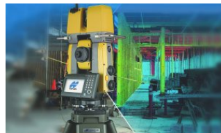
Topcon launches GTL- 1000 scanning robotic total station to