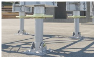
RMD Kwikform introduces new lightweight propping