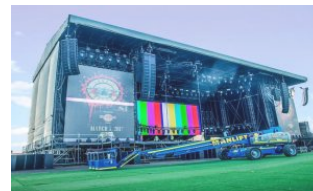
Are you hosting an upcoming event? Manlift has you...